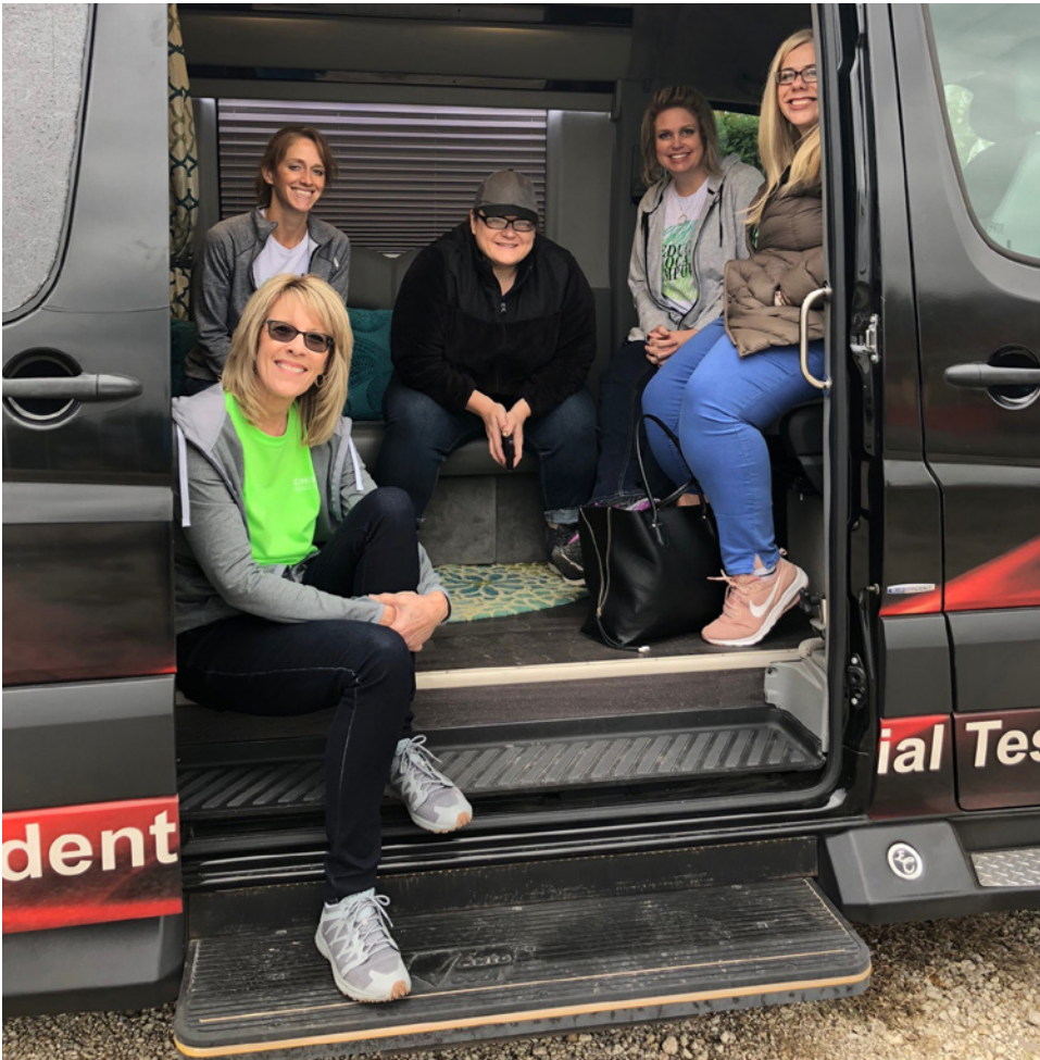
Members of the Victim Response Team on the LifeChoices medical mobile unit.