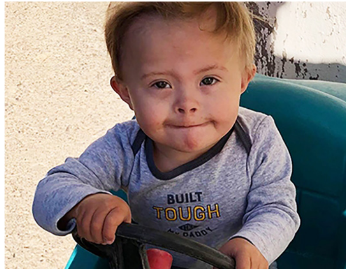
Tig saved by APR

Progesterone has been used safely off-label for over five decades to maintain pregnancy in early miscarriage cases due to low progesterone levels. This natural hormone functions during a pregnancy to do the following: prepare the endometrium, develop the placenta, inhibit contractions and keep the cervix closed. Progesterone administration for abortion pill reversal was found safe and effective in a published observation case series study involving 547 women. 29 A 1999 FDA review