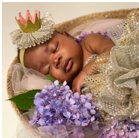
Queen saved by APR

If an APR provider is not available in a caller’s immediate area, the APRN Hotline consultants may provide a description of the reversal protocol to a woman’s