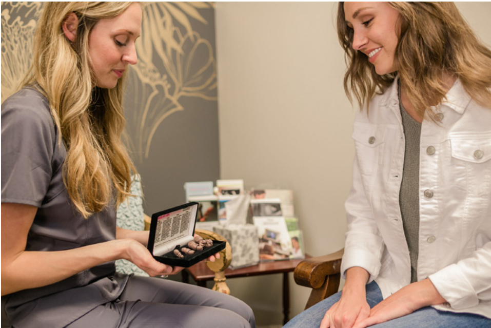
Registered nurse talking with a patient at Hope Pregnancy Center in College Station, Texas.

FAB methods encompass Fertility Education and Medical Management (FEMM), Natural Family Planning methods and lactation methods. The CDC categorizes FAB methods into symptom-based and calendar-based designations. 13 Specific evidence-based FAB methods include: Billings Ovulation Method, Marquette Method, Creighton Model, FEMM, Couple to Couple League and 2 Day Method. 14