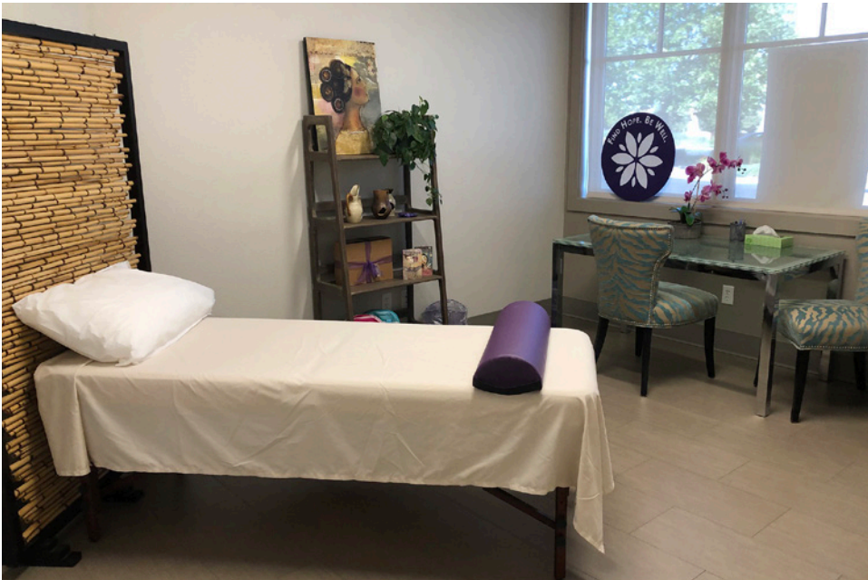
Wellness and spa room at the Stanton Healthcare Clinic in Meridian, Idaho which opened in 2019.

cess of launching these medical exams and care in the U.S. Prenatal care is offered through the second trimester on an individual basis. Spa and wellness care as well as fertility awareness-based methods are additional service areas at Stanton Healthcare locations.