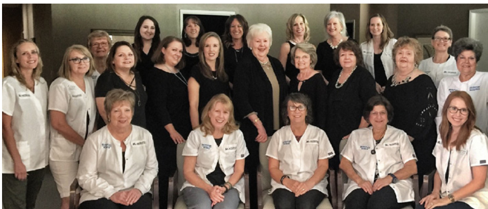
Staff and medical team at Metroplex Women's Clinic with four locations in Arlington, Texas.

In 2019, 47,431 non-medical personnel volunteered their time at pregnancy centers in America.