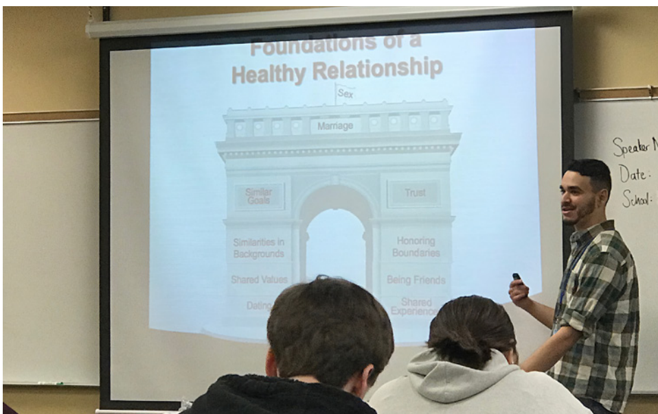
Staff from Life Options in Yakima, Washington leads an SRA education community-based presentation in a class setting to students.

In addition to following a poverty-prevention, research-based model, SRA