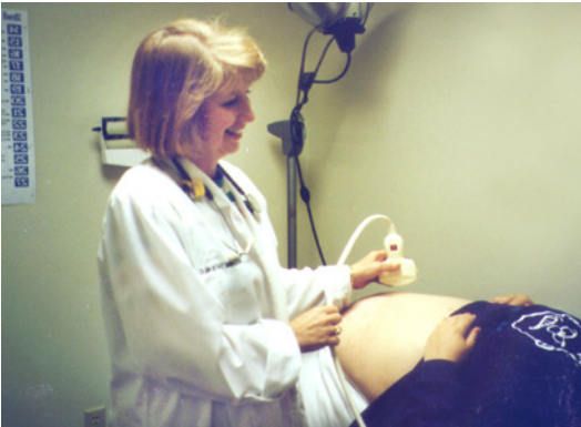
Registered Nurse performing a pregnancy confirmation ultrasound on a patient at Elizabeth's New Life Center in Dayton, Ohio in 1994.

The commitment to providing care at the highest levels resonated with physicians and health care providers at pregnancy centers across the country. They too answered a call to aid women and families with needed alternatives to abortion through the compassionate care offered as a testimony to love in action.