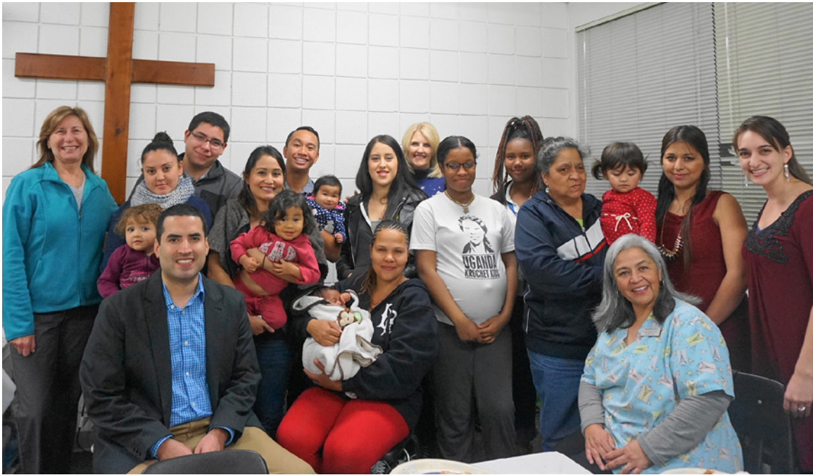
Prenatal education class through Obria Medical Clinics Beginnings Prenatal Program held at the Salvation Army in Long Beach, California.

the course of a pregnancy for additional support and to complement prenatal care from a medical provider. The prenatal education helps to promote positive health outcomes for both moms and babies and the ongoing mentoring role at centers serves as a social support for expectant moms and couples. Examples of prenatal education lessons from evidence-based curricula include eating for two, what is safe in pregnancy, bonding with your newborn baby, emotions of pregnancy, infant hygiene, bonding with your unborn, caring for yourself after birth, breastfeeding – goals and benefits, and postpartum depression.