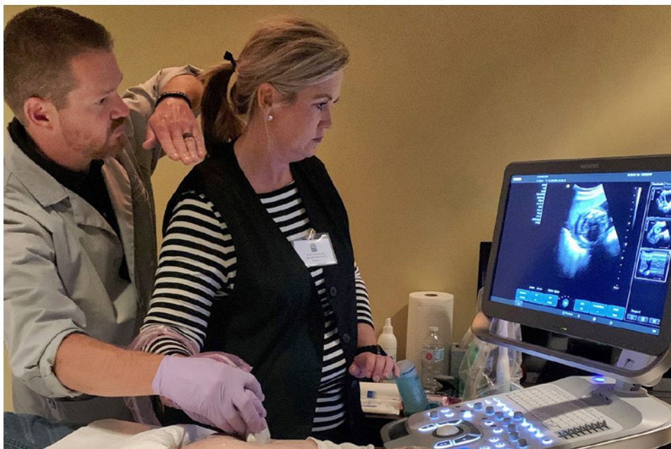
Ultrasound training at NIFLA's Institute in Limited Obstetric Ultrasound in 2019.