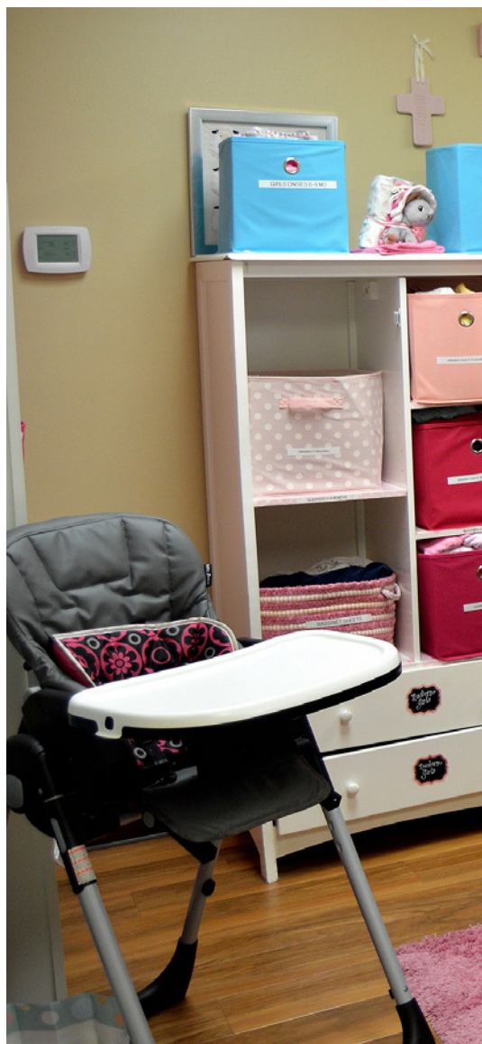
Essential baby items boutique at Agape Center on Merritt Island, Florida.

The “Total Value” of all services and material assistance provided by pregnancy centers in 2019 is calculated using cost estimates for services, consultations, classes, presentations to youth, and baby items provided to clients. Hours provided are