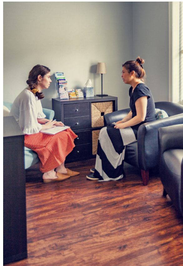
Options consultation session with client and client advocate at Assist Pregnancy Center in Annandale, Virginia.

Upon the reading of her own positive pregnancy self-test, a woman is then advised that she will need a medical professional to confirm her pregnancy. If the test occurs at a center which offers limited pregnancy confirmation ultrasounds, she is offered an appointment to formally diagnose the pregnancy. If the center does not offer ultrasound on-site, a woman is provided with referrals to providers in the community for follow up. With the woman’s permission, a client advocate will then offer to discuss the client’s three legal options: giving birth and raising the child, giving birth and making an adoption plan for the child, and abortion. The first two options represent a “parenting” option and are life-affirming.