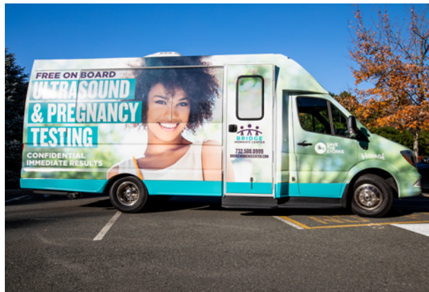
Right Save the Storks bus exterior for Bridge Women's Center in Old Bridge, New Jersey.

do see scheduled appointment clients, MUs see unscheduled “walk-up” clients/patients more frequently.