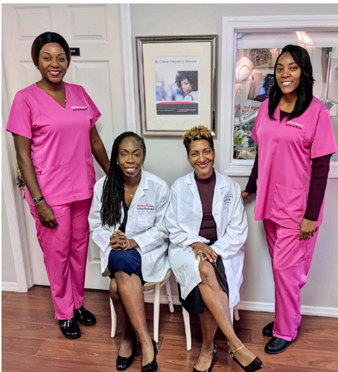
Medical team volunteers at My Choice Pregnancy Services, the on-site medical office located with New Beginnings Center of Hope in Jamaica, New York.

As the number of medical pregnancy centers or clinics in the U.S. continues to grow, from 50 in 1998 to 2,132 in 2019, so too does the number of medical professionals devoting their expertise and time at these non-profit, community-based organizations. These credentialed individuals provided ultrasounds, medical exams, STI/STD testing and treatment services, well-woman exams, fertility awareness-based education, prenatal care, lactation/breastfeeding consultations, and more. The numbers are reflective of a body of medical professionals from multiple disciplines who support and affirm the importance of high-quality, life-affirming healthcare.