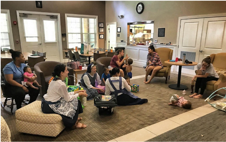
Commons Area with residents, their children, volunteers, and staff at MiraVia maternity residence located on the campus of Belmont Abbey, North Carolina. MiraVia served 615 mothers in 2019.

Maternity homes programs continue to develop and tailor their programmatic outreach to the needs of those in their communities. In Chicago, homelessness has been identified as a leading cause of the pressure women feel to choose abortion. Aid for Women owns and operates five pregnancy centers and two residential programs which provide for continued housing for moms and their children as needed after the birth of their babies. Their first maternity home, Heather’s House, is a more traditional maternity housing setting where a pregnant woman and new mom can develop life, education, and job skills while in a safe and secure setting. The second residence, Monica’s House, serves as a transitional home for Heather’s House residents who have given birth and are either going to school or working. The environment at Monica’s House affords greater independence as residents steadily work toward their goals with the stability of secure housing.