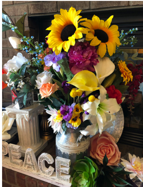
After-abortion healing event to commemorate lives lost to abortion at Clarity Solutions center in Elizabethtown, Kentucky.

health promotion/disease prevention outcomes across many high-risk health behaviors including illicit drug use, underage drinking, violence, and smoking. 21 It communicates practical tools and information for practicing the behavior of risk avoidance. For those who are already sexually active, the approach promotes cessation using evidence-based behavior change health models. These youth have traditionally been funneled into a risk-reduction, physical-only focused clinical strategy by the public health community (and have not always received necessary screening for sexual assault). By giving youth the additional tools and medically accurate and referenced information, they are provided the approach geared towards optimal health outcomes including sexual wholeness.