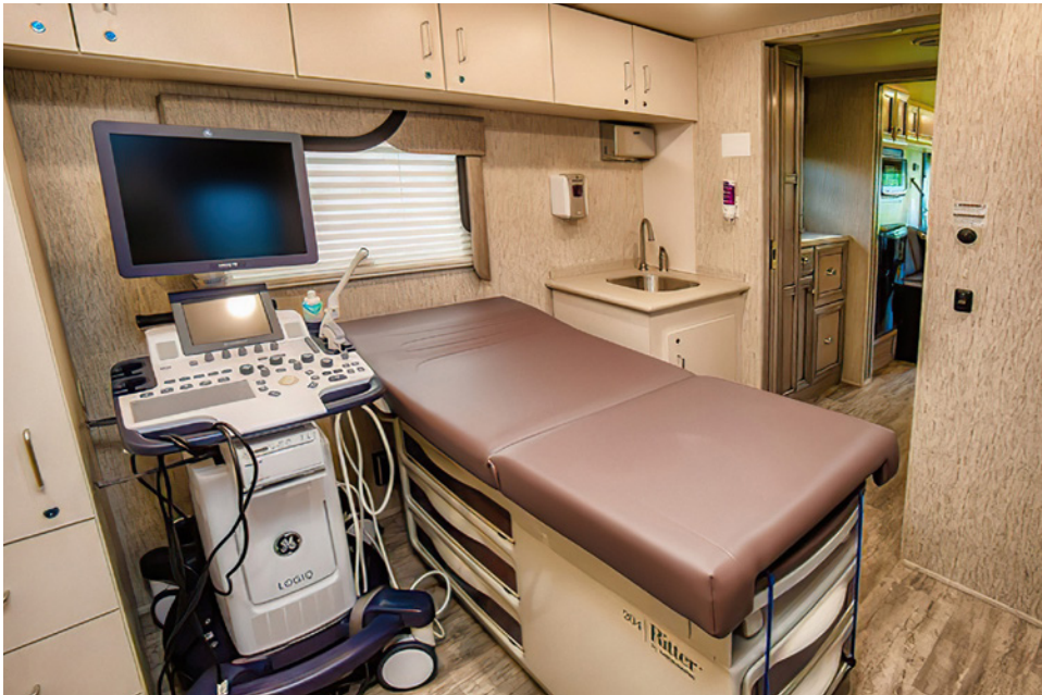
Top Interior of an ICU Mobile model medical mobile unit, operated by Skylark in Brunswick, Georgia.