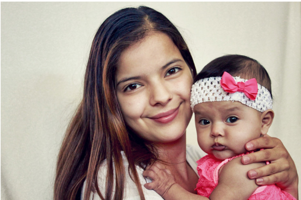
Client and her baby who received care at Life Options in Grandview, Washington.

Referrals for resources such as job centers and skills training, education programs, peer support services to aid in drug addiction recovery, housing, adoption