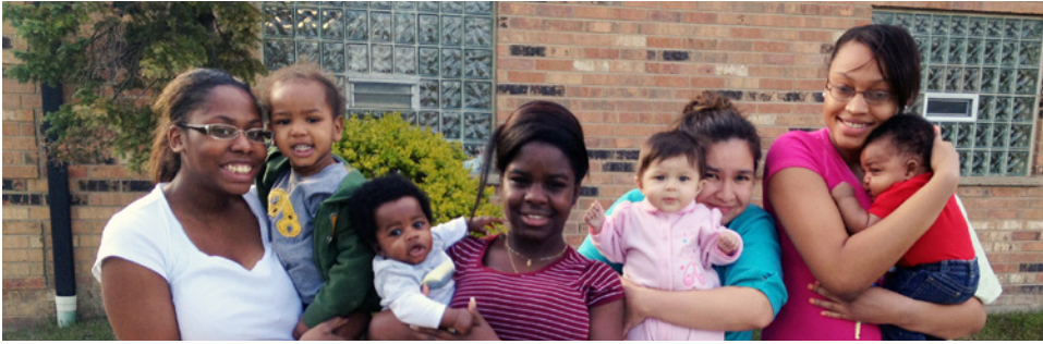
Aid for Women Heather's House residents and their children in Chicago, Illinois.