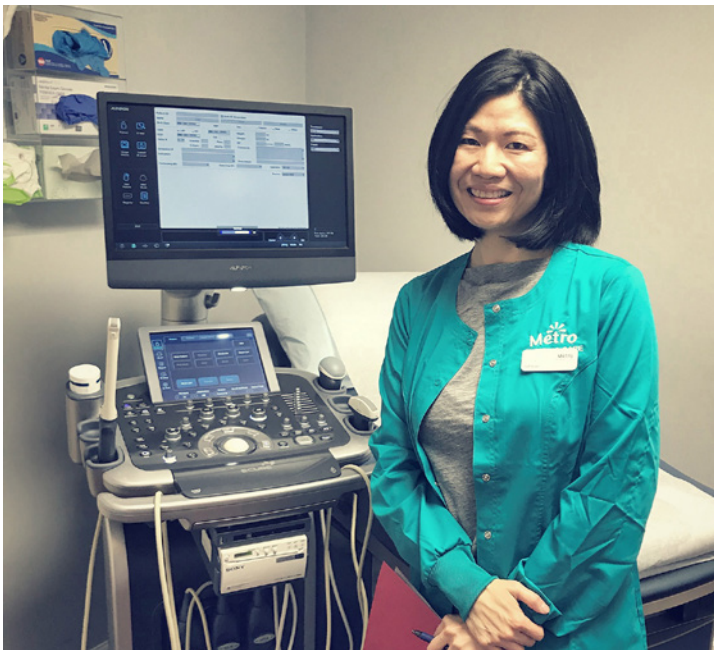
Registered nurse at Assist Pregnancy Center in Annandale, Virginia.

Medical pregnancy centers or clinics perform limited ultrasounds in accordance with specific standards and guidelines set forth by medical professional bodies, including the American Institute of Ultrasound in Medicine (AIUM); Association of Women's Health, Obstetric and Neonatal Nurses (AWHONN); the American College