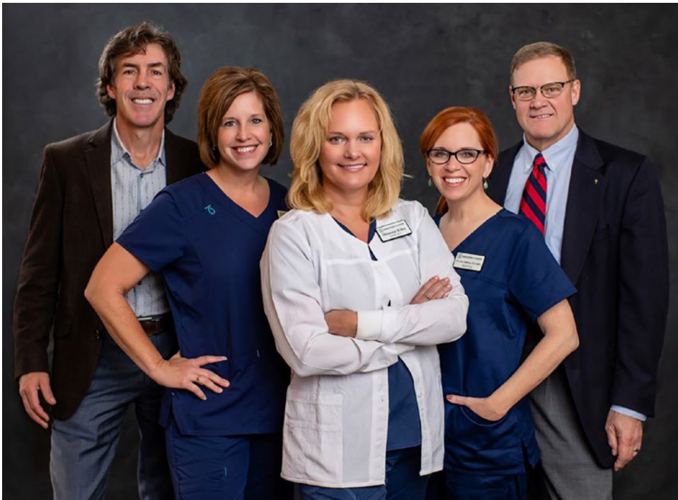
Anchor of Hope medical team in Sheboygan, Wisconsin. Center provides Abortion Pill Reversal, STI/STD testing and treatment as well as pregnancy confirmation ultrasounds among its services.

The scope of pregnancy center medical and health services continues to expand as needs present in individual communities and as qualified staff and/or volunteers with expertise become available. The standard of providing excellent care across the continuum of client services remains constant at pregnancy centers. Maternal and child health and women's health services offered at some pregnancy centers include: childbirth classes, lactation/breastfeeding consultations, certified dietitian/