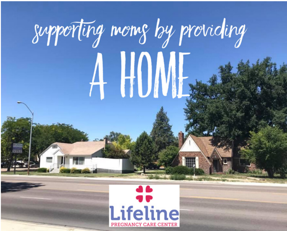
LifeLine Pregnancy Care Center founded in 1986 (left) and the house for The Nesting Place maternity home next door (right) in Nampa, Idaho.

bled an addiction support resource to share about behavioral theory-based practices and strategies called, “Women in Progress: Maternity Housing Considerations for Women Who Experience Addiction.”