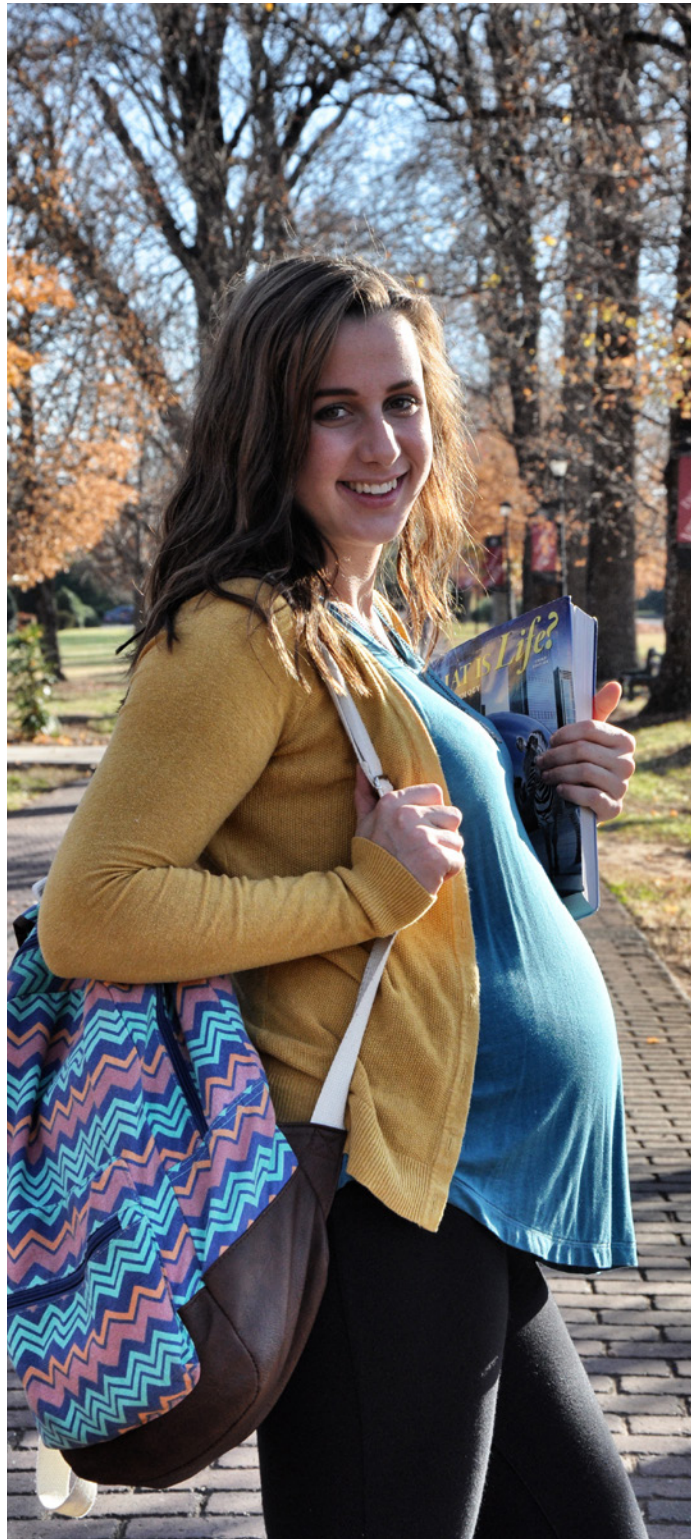
A former resident of MiraVia's college maternity residential program.