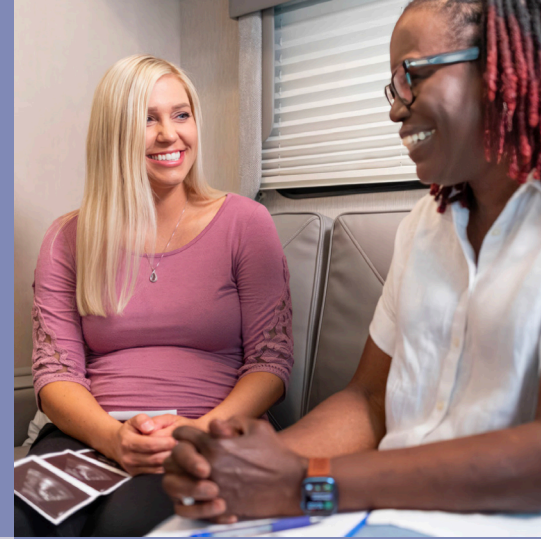
Client advocate session onboard an Image Clear Ultrasound Mobile (ICU Mobile) medical mobile unit in Akron, Ohio.

*a fraction of centers charge a low fee for STI testing